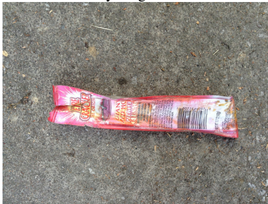
Plastic wrappers ... this one looks contaminated with food. Let's TRASH it.