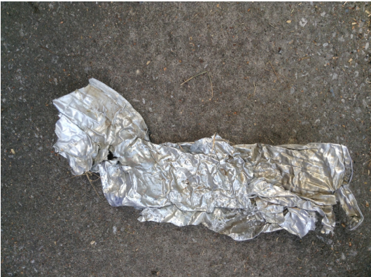
Thin scrap metal CAN be recycled at Southern Recycling ... if it's clean.