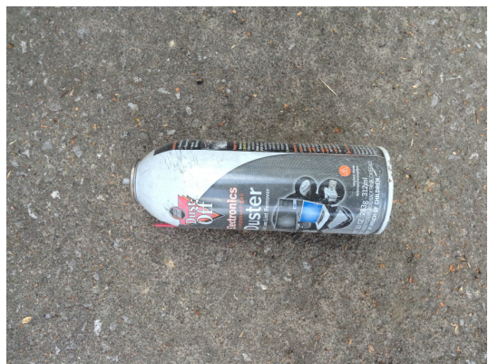
Aerosol cans CAN be recycled with other metals at Southern Recycling IF they are empty.