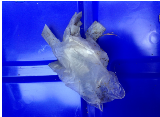
Rubber gloves ... pretty dirty. TRASH. Let's not add that to the recycling stream.