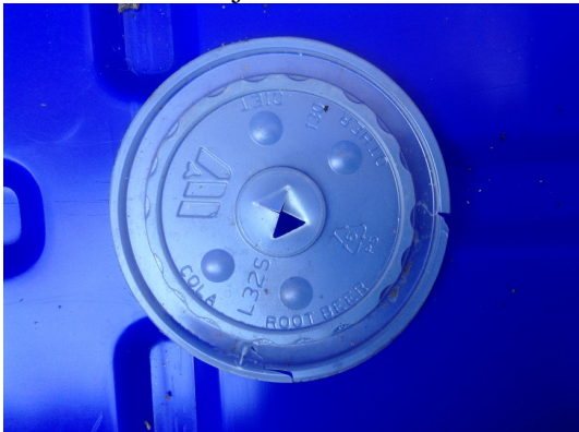
Clear plastic drink lid. Can you see the #? It looks like a #6. TRASH But maybe some day soon ...