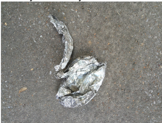
Aluminum foil can be recycled at Southern Recycling ... if it's clean. But it probably isn't. TRASH it.