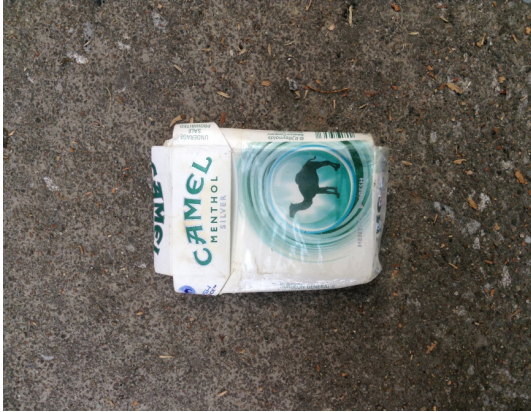
Cigarette boxes contain cardboard, plus plastic on the outside and foil on the inside. Sort it all out or just TRASH it.