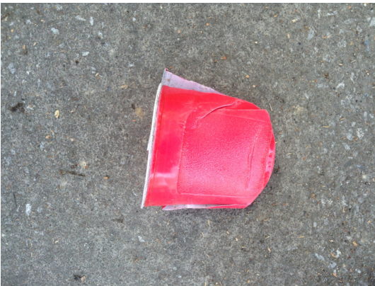
Solo cups CANNOT be recycled in Carbondale. But maybe some day.