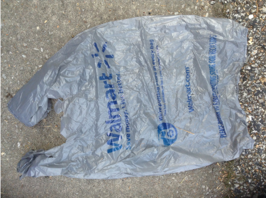
Plastic shopping bags CAN be recycled at the grocery store or at Southern Recycling, but not in the City's blue bin.