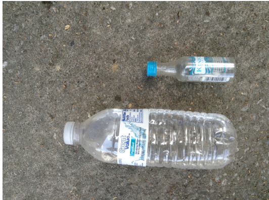
Plastic bottles #1 or #2 CAN be recycled. Put them in the BLUE bin or bring to Southern Recycling.